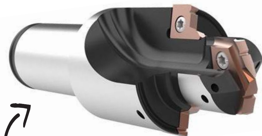
▶ AccuPort 432®